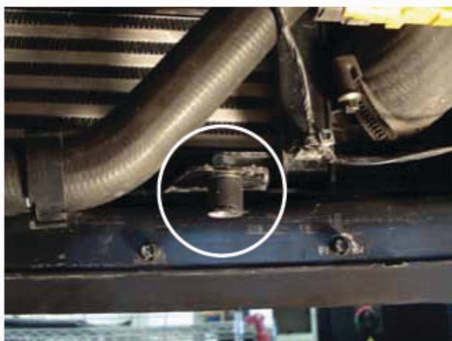
Step 3 - Install the (2) rubber standoffs as shown above. Using the supplied nuts and washer.