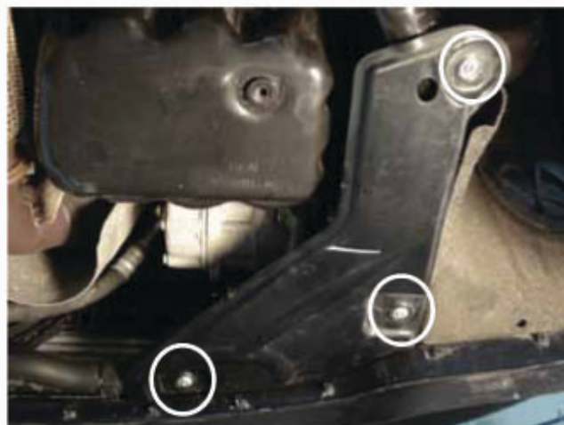
Step 1 - Remove the (2) plastic covers as shown above. These will not be reused.