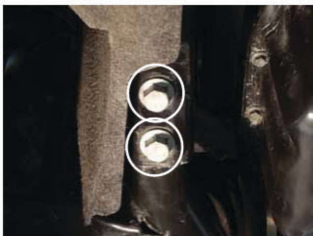
Step 2 - Remove the (2) Subframe bolts on each side of the car and install the skid plate brackets as shown above. Note: Work on one side of the car at a time.